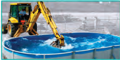
A vigorous backhoe test is performed prior to the launch of each new pool.

The Channel-Lok I Compact-Buttress System requires fewer angled supports (buttresses), yet provides an uncompromising level of strength. With fewer supports, space and side accessibility to the pool is increased while installation time is reduced.