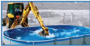
A vigorous backhoe test is performed prior to the launch of each new pool

The Engineering design of the Channel-Lok II buttress system has been developed to require fewer buttresses without compromising its strength and reliability. Along with Atlantic's unique structural system and fewer buttresses, the Channel-Lok II buttress system will be appreciated for its good looks and ease of installation. This buttress system can be installed on a flat concrete surface. There is no excavation or digging needed on a flat compacted level surface.